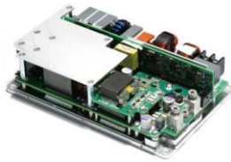
2.5KW DC/DC Converter Module