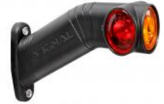
D14426 FA3 LED - Right End outline marker lamp LED 12/24V...