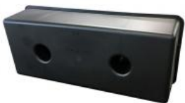
D14721 FCA - Protective cover for rear lamp's connector