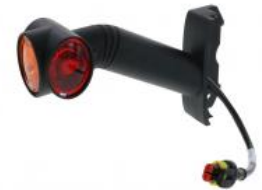
D14781 FA3 LC12 LED - End outline marker lamp LED left side 12/24V...