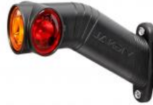
D14425 FA3 LED - Left End outline marker lamp LED 12/24V cristal...