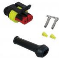
D13880 CONN - SUPERSEAL 2 way female connector repair kit